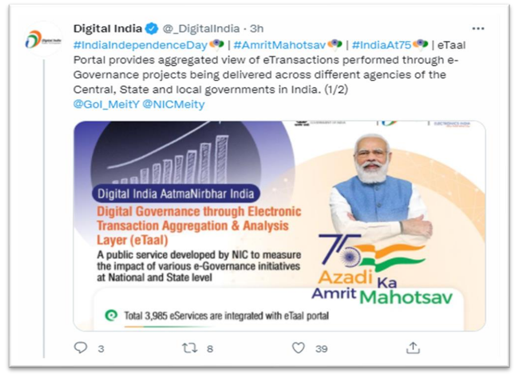
Figure 1:Azadi ka Amrit Mahotsav - Digital India AatmaNirbhar India, 19<sup>th</sup> August 2021

eTaal Portal provides aggregated view of eTransactions performed through e-Governance projects being delivered across different agencies of the Central, State and local governments in India.