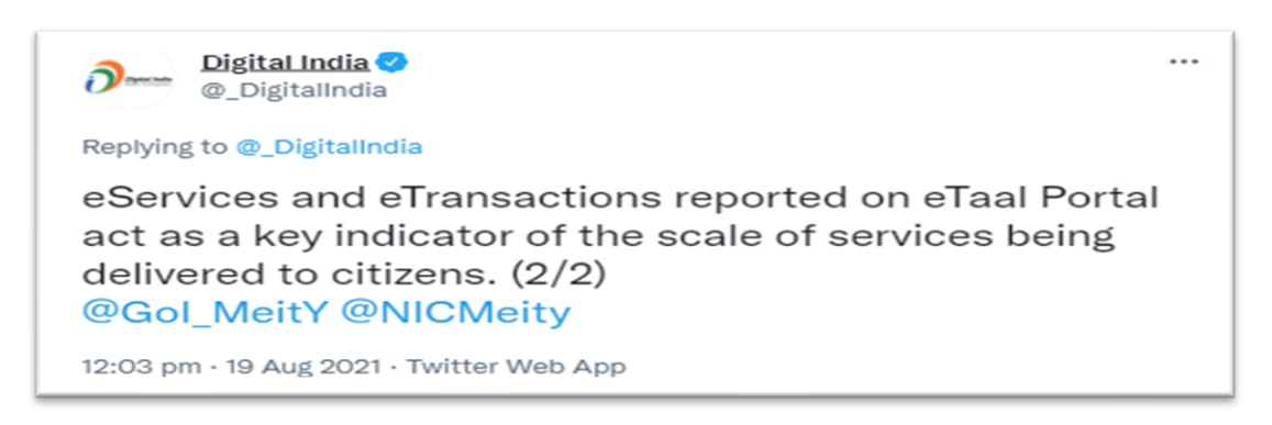
Figure 3: Digital Governance through eTaal